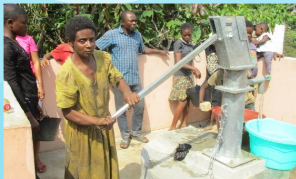
Claretian Water Project in Cameroon

Creator God! Your Spirit fluttered over the surface of the waters; you gather the seas in their places and direct the course of the rivers and you send rain upon the earth to bring forth life. We praise you for the gift of water. Instil in us a sense of wonder and delight for water and for all your gifts that we may receive them with gratitude. That we may care for them with love and generously share them with all your creatures for the honor and glory of your name. AMEN