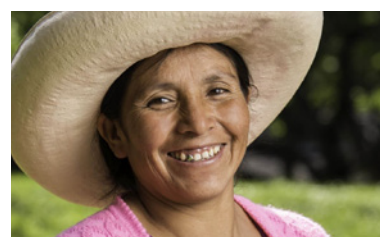
MÁXIMA ACUÑA ATALAYA

Renowned Kenyan social, environmental and political activist, she was the first African woman to win the Nobel Prize. She founded the Green Belt Movement, an organization focused on tree planting, environmental conservation and women's rights.