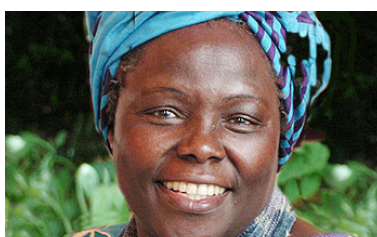
WANGARÍ MUTA MAATHAI

Defender of the environment and solar energy. He became famous in 1970 as the coordinator of the first Earth Day. Hayes founded the Earth Day Network and expanded it to more than 180 nations.